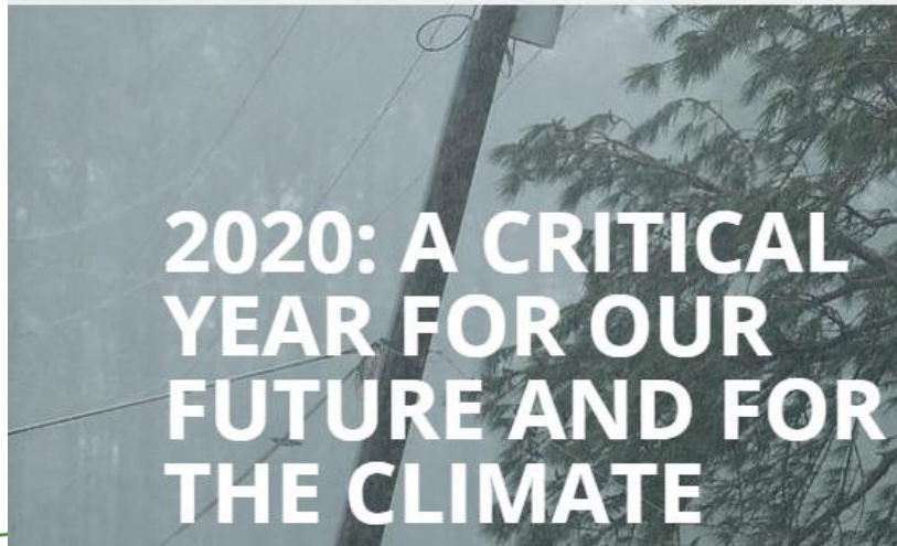
Global fossil fuel CO 2 emissions